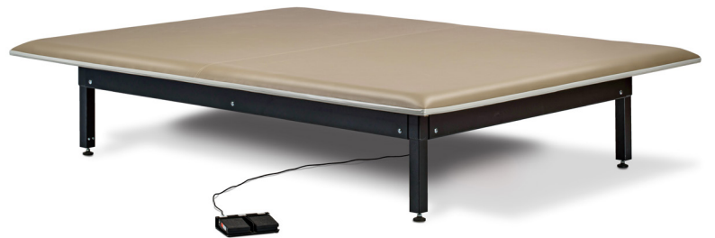
MODEL 270-57 SPECIFICATIONS