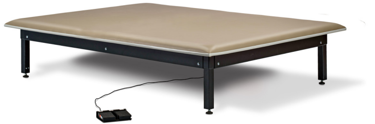
MODEL 270-46 SPECIFICATIONS

IMPORTANT NOTE: Due to the size of the 270-68, it MUST ship to a truck height dock.