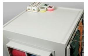
Raised Edge on Top