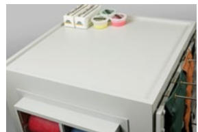
Raised Edge on Top