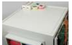
Raised Edge on Top