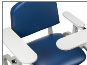
665 ClintonClean™, Armrest and Flip Arm(s)