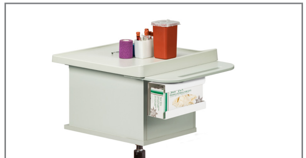
GW-2000 Single White Steel Glove Box Holder