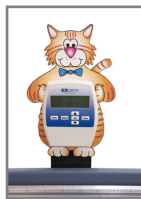
078-K Kitty Scale Pal