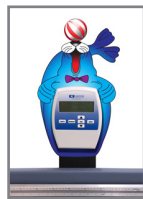
078-S Seal Scale Pal