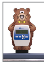
078-B Bear Scale Pal