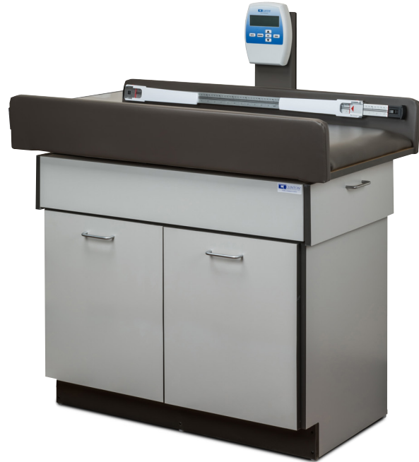
MODEL 7820 SPECIFICATIONS