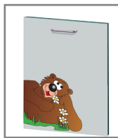
Select Series Graphics