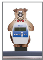
078-D Doggie Scale Pal