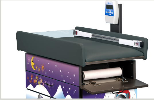
Paper Dispenser Choose to access concealed paper dispenser from either end

Infantometer Built-in infantometer with folding ends for measuring height