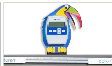
78-P Parrot Scale Pal