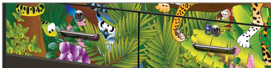
055 Drawer Locks