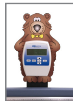
078-B Bear Scale Pal