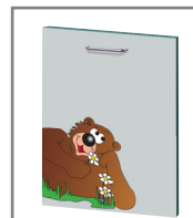
Select Series Graphics