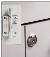
066 Door & Inside Latch Combo