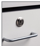
055 Drawer Locks