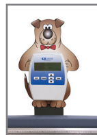
078-D Doggie Scale Pal