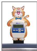
078-K Kitty Scale Pal