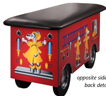
opposite side and back detail