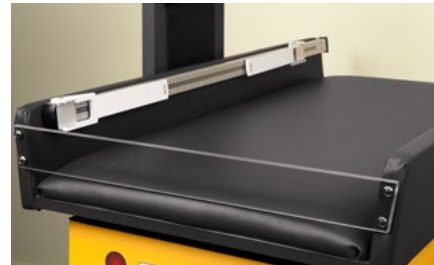
top rimmed on 3 sides