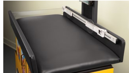
beveled sides & rounded corners