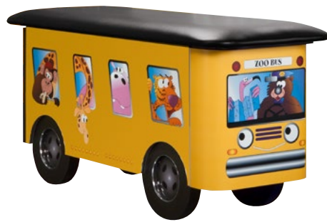
opposite side and front detail