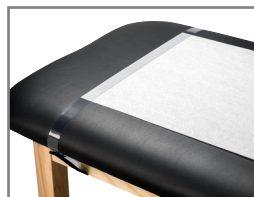
040 Paper Cutter