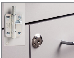
066 Door & Inside Latch Combo