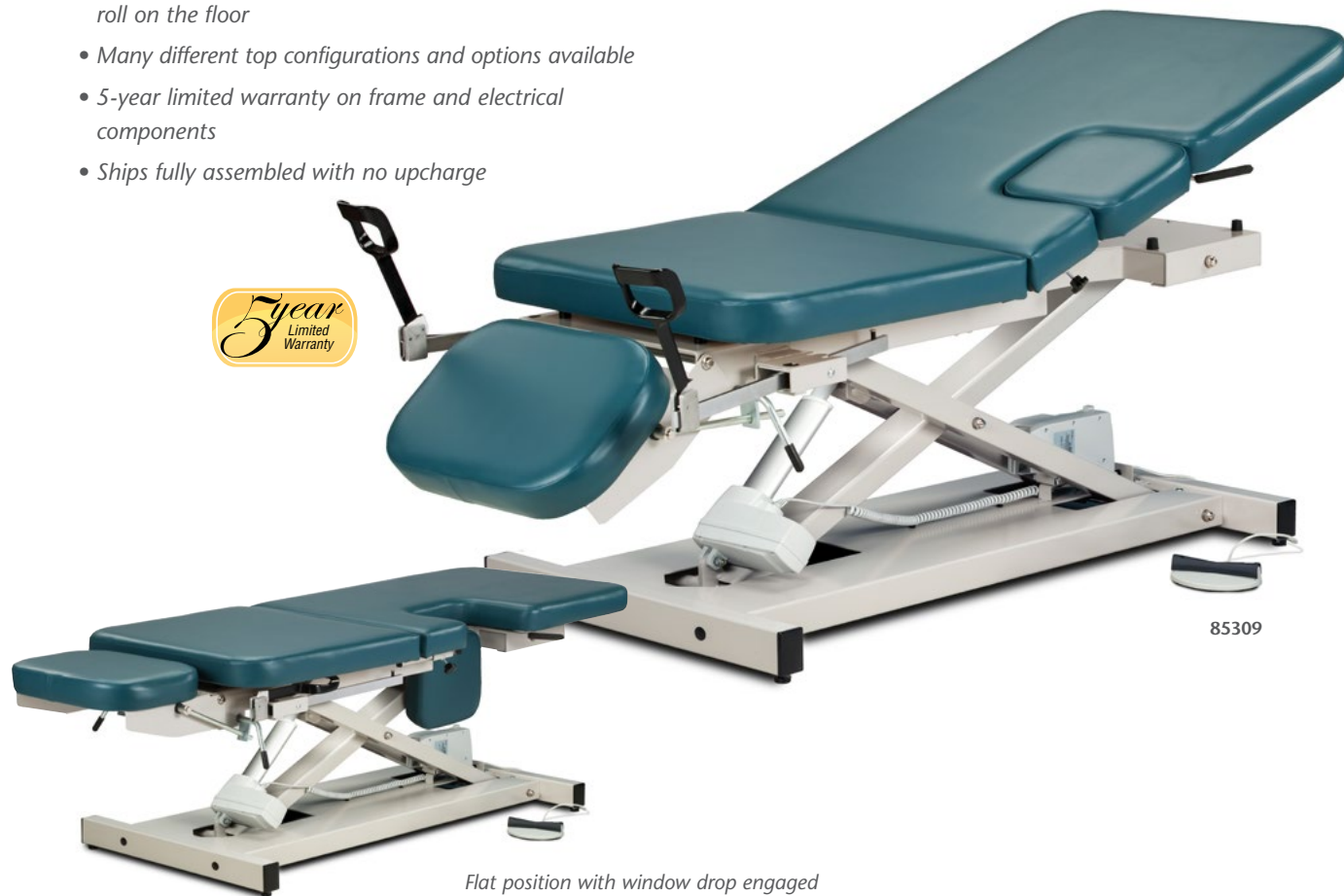
Flat position with window drop engaged