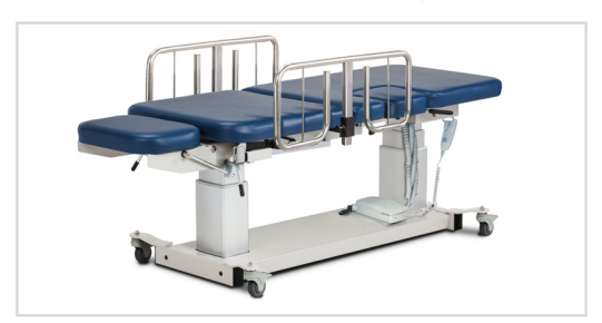
Optional Side Rails & Casters