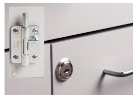
066 Door and Inside Latch