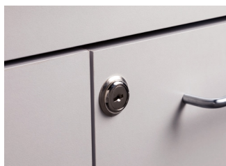
055 Door & Drawer Locks