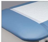
040– Paper Cutter