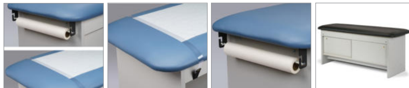
034– Paper Dispenser & Holder Combo