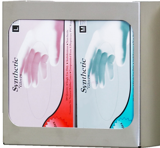
Shown in the horizontal position