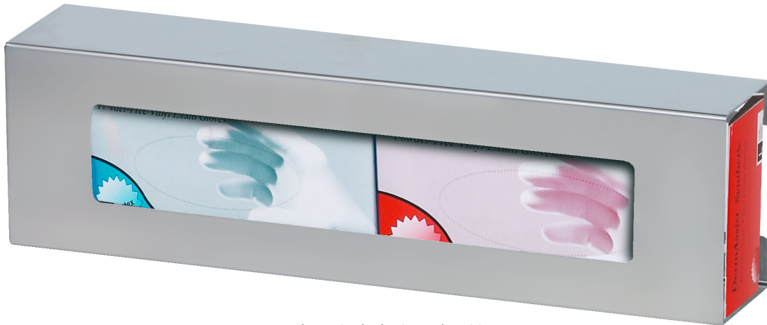
Shown in the horizontal position