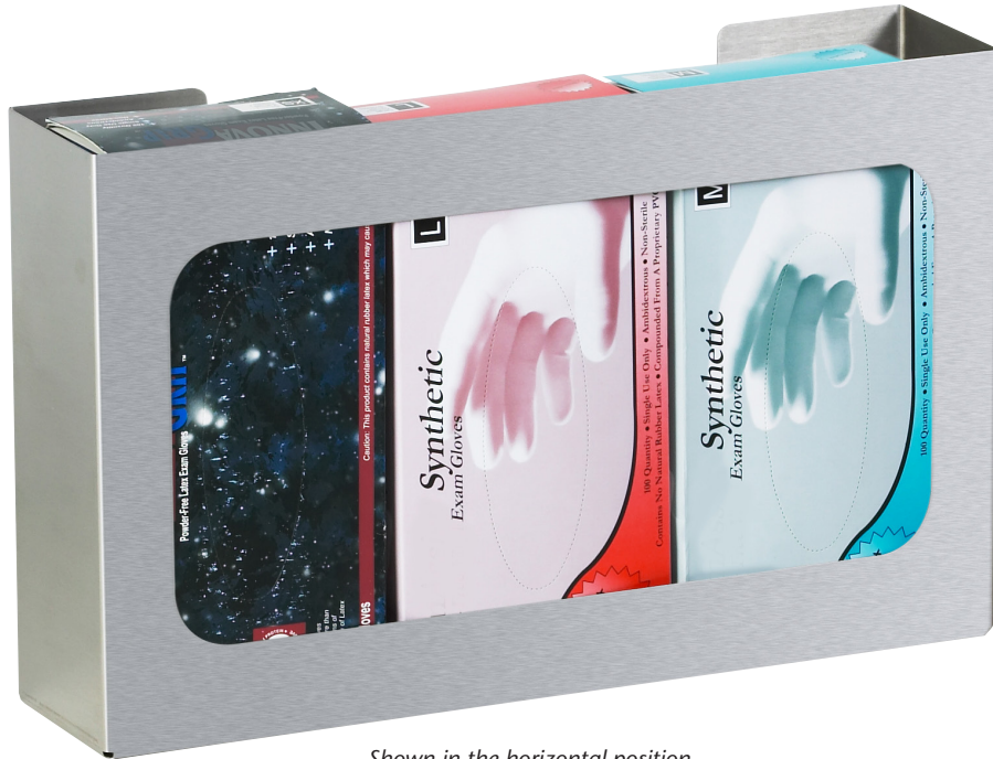
Shown in the horizontal position