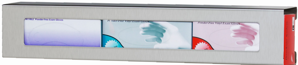
Shown in the horizontal position