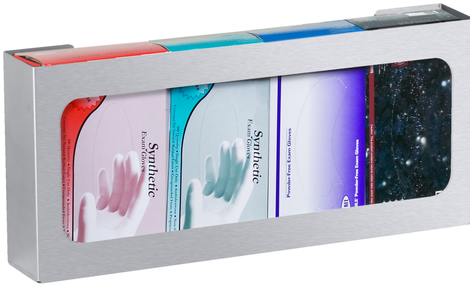
Shown in the horizontal position