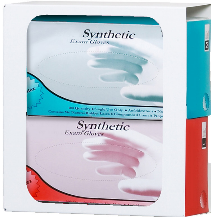
Shown in the vertical position