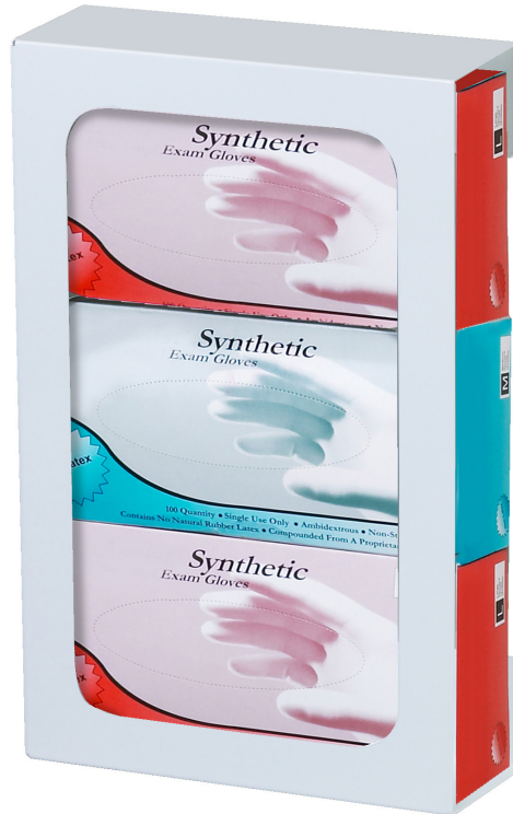
Shown in the vertical position