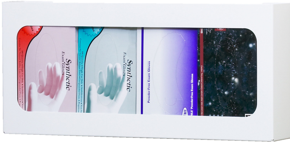
Shown in the horizontal position