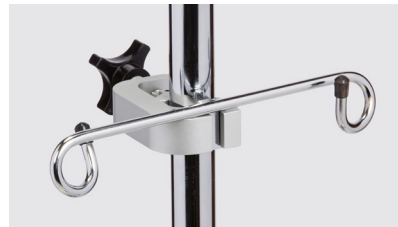
IV-57 Single Ram's Horn