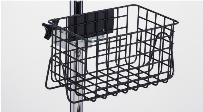
Heavy Duty Black Epoxy Wire Basket IV-51B – 14" x 8" x 8.5" IV-52B – 12" x 6" x 6.5"