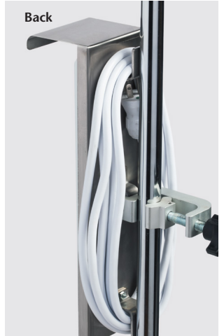
IV-50 Pole Outlet Strip