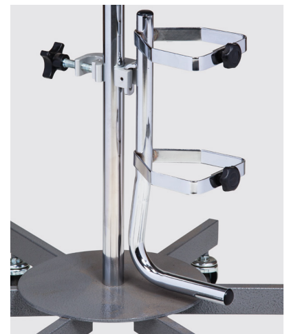
IV-44 Oxygen Cylinder Holder