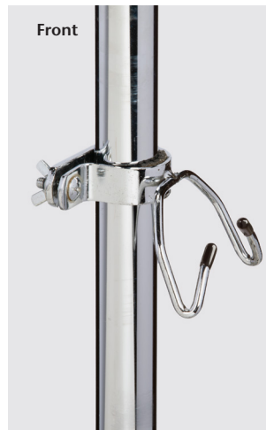
IV-56 Drainage Hook