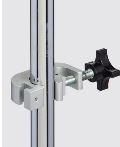
IV-41 Universal Clamp