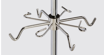
IV-55 Extra Hooks and Organizer Hooks