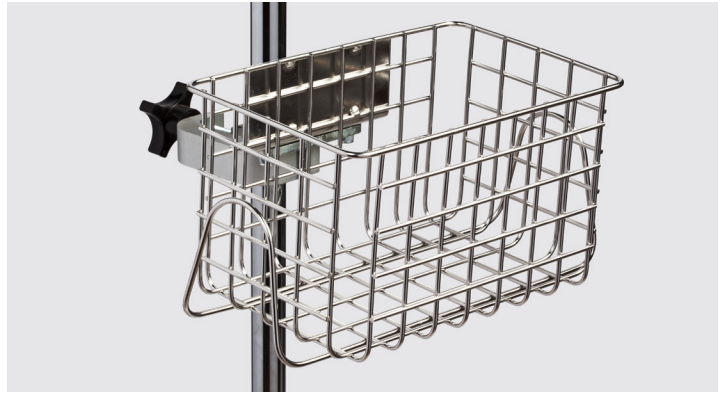
Heavy Duty Stainless Steel Wire Basket IV-51S – 14" x 8" x 8.5" IV-52S – 12" x 6" x 6.5"