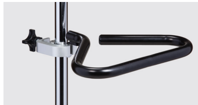
IV-43 Steering Handle