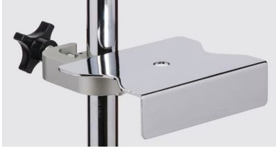
IV-46 Pump Tray Support