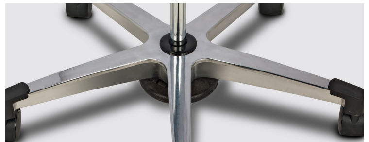
IV-48 2 lb. Base Stability Weight / V-485 2 lb. Base Stability Weight