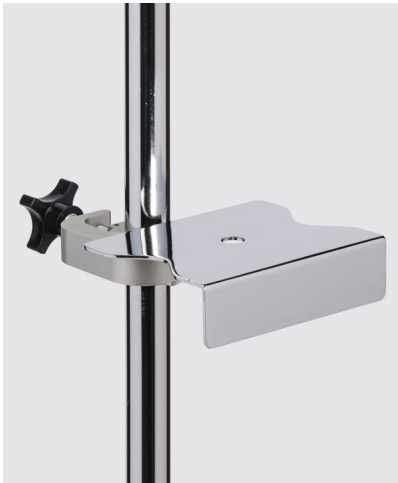
IV-46 Pump Tray Support