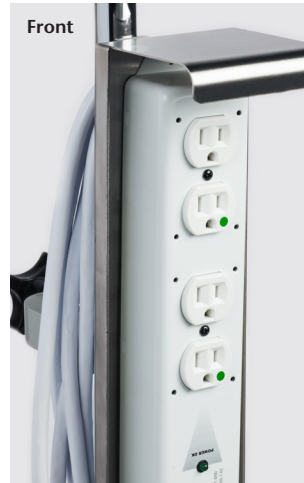
IV-50 Pole Outlet Strip