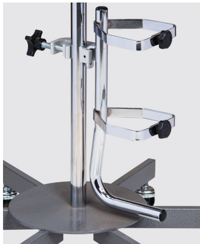
IV-44 Oxygen Cylinder Holder