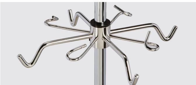
IV-55 Extra Hooks and Organizer Hooks