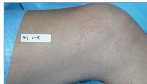
Competitive Surgical Skin Marker Post Chloraprep™* Application