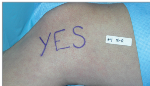
Devon™ Surgical Site Mini-Marker Prior to Chloraprep™* Application