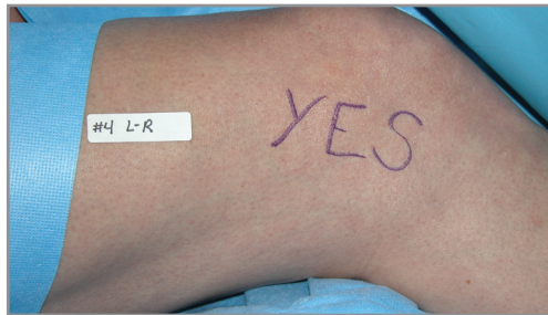
Competitive Surgical Skin Marker Prior to Chloraprep™* Application