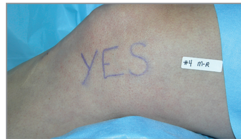
Devon™ Surgical Site Mini-Marker Prep Resistant Post Chloraprep™* Application