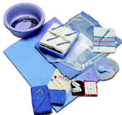
C-Section Deluxe Kit