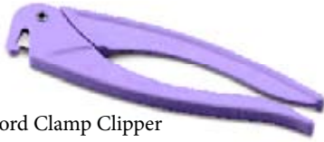
Cord Clamp Clipper