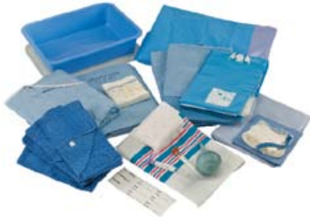
Vaginal Deluxe Delivery Kit