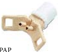
CPAP Nasal Cannula