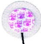
1051NPSM Radiolucent wire