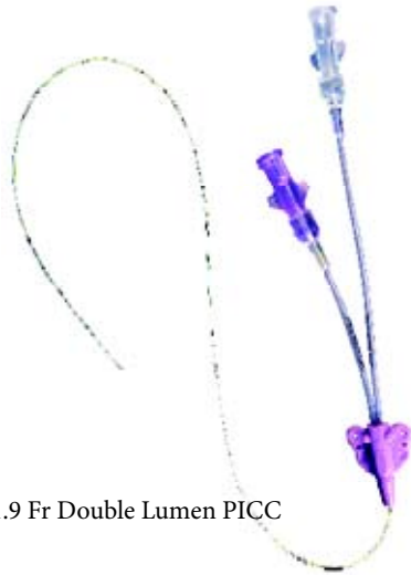
1.9 Fr Double Lumen PICC