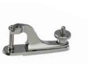
Single Sterile Clamp