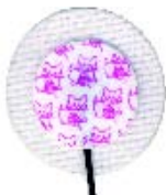
1051NPSM Radiolucent wire