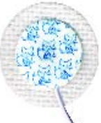
1052NPSM Non-radiolucent wire