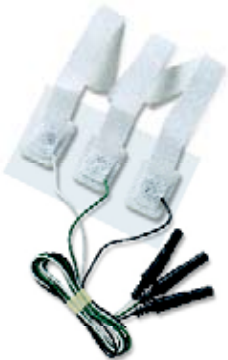
EP30018 Limb Band