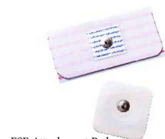
FSE Attachment Pads