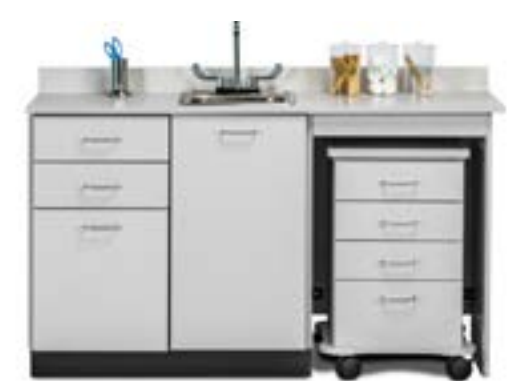
48060MR Shown with Optional -022 Sink

! WARNING: This product can expose you to chemicals, including chromium, which is known to the State of California to cause cancer and reproductive harm.