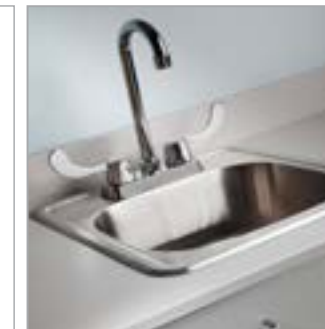
022 Stainless Steel Sink and Gooseneck Chrome Faucet set