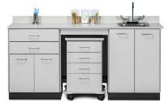
48072SR Shown with Optional -022 Sink