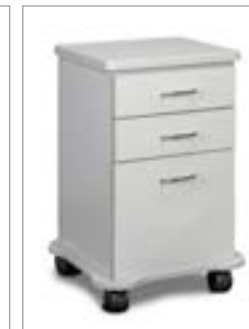
043—2 drawers & 1 door