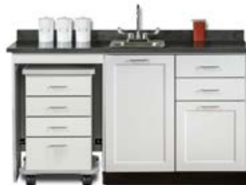
58060ML Shown with Optional -022 Sink