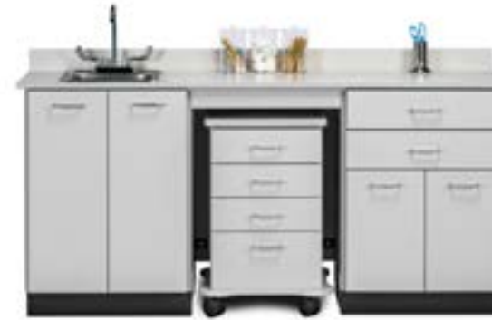
48072SL Shown with Optional -022 Sink