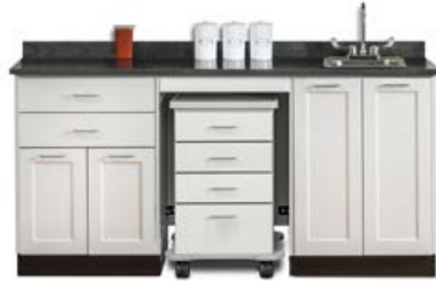
58072SR Shown with Optional -022 Sink