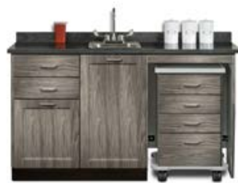
58060MR Shown with Optional -022 Sink

! WARNING: This product can expose you to chemicals, including chromium, which is known to the State of California to cause cancer and reproductive harm.