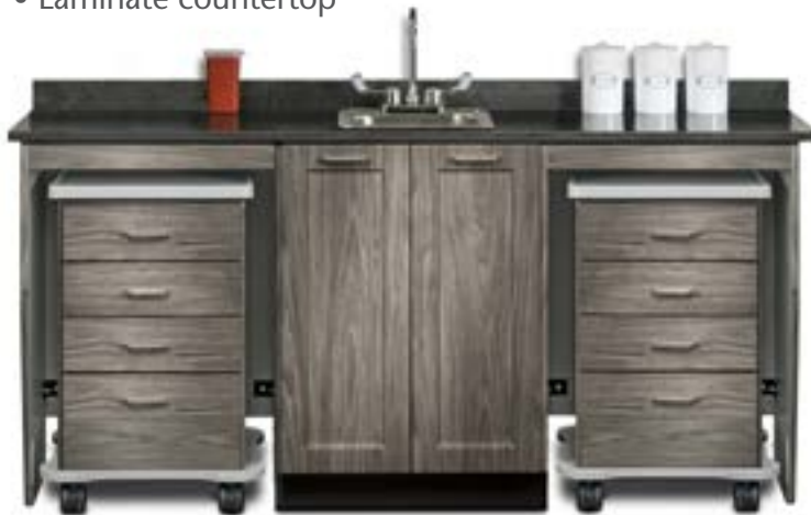
58072D Shown with Optional -022 Sink