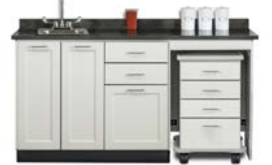
58066R Shown with Optional -022 Sink