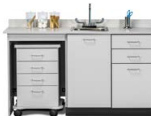
48060ML Shown with Optional -022 Sink