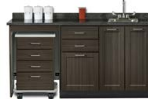
58066L Shown with Optional -022 Sink