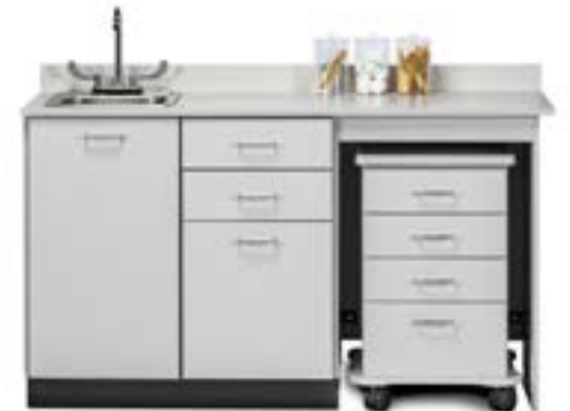
48060R Shown with Optional -022 Sink