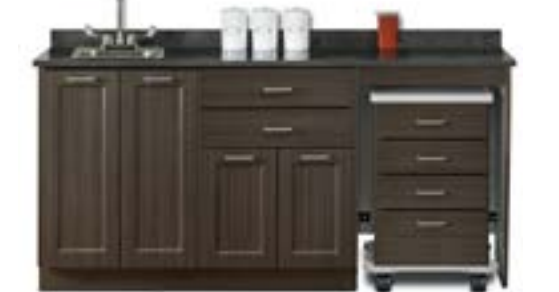
58072R Shown with Optional -022 Sink