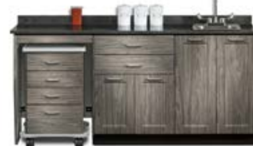
58072L Shown with Optional -022 Sink