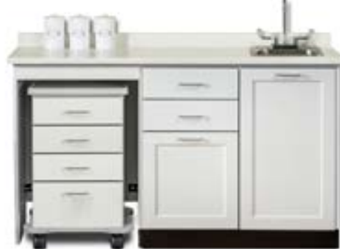
58060L Shown with Optional -022 Sink