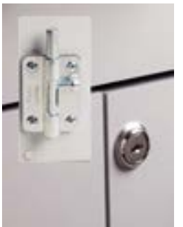
066 Door Locks & Inside Latch