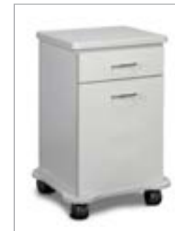
042—1 drawer & 1 door