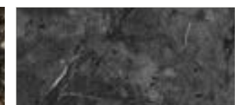
P3 Black Alicante

⚠ WARNING: This product can expose you to chemicals, including chromium, which is known to the State of California to cause cancer and reproductive harm.