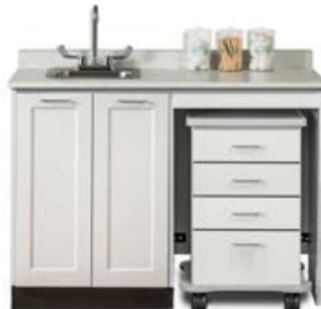
58048R Shown with Optional -022 Sink