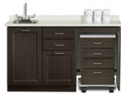
58060R Shown with Optional -022 Sink