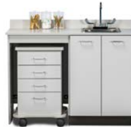
48048L Shown with Optional -022 Sink