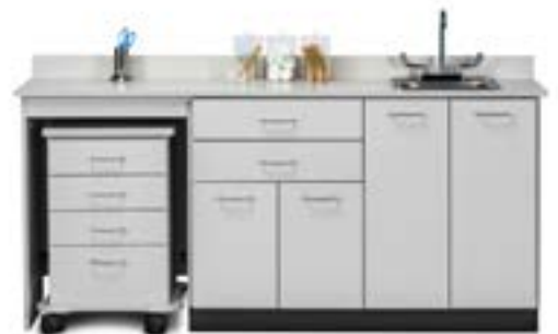
48072L Shown with Optional -022 Sink