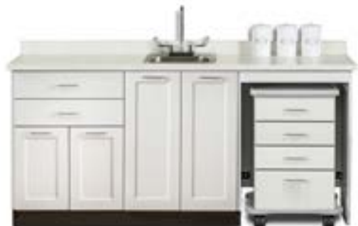
58072ML Shown with Optional -022 Sink