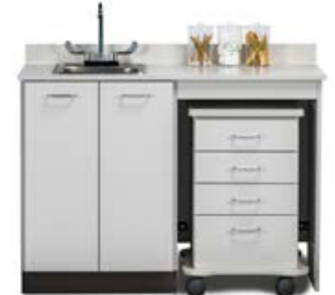
48048R Shown with Optional -022 Sink