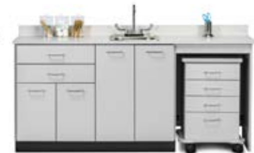
48072MR Shown with Optional -022 Sink