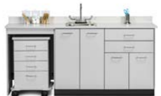
48072ML Shown with Optional -022 Sink

⚠ WARNING: This product can expose you to chemicals, including chromium, which is known to the State of California to cause cancer and reproductive harm.