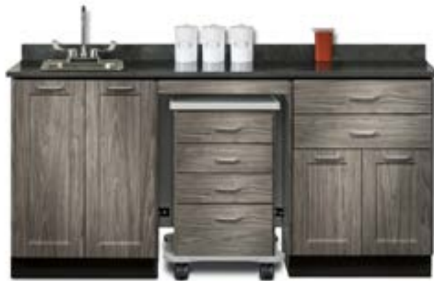
58072SL Shown with Optional -022 Sink