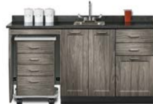
58066ML Shown with Optional -022 Sink