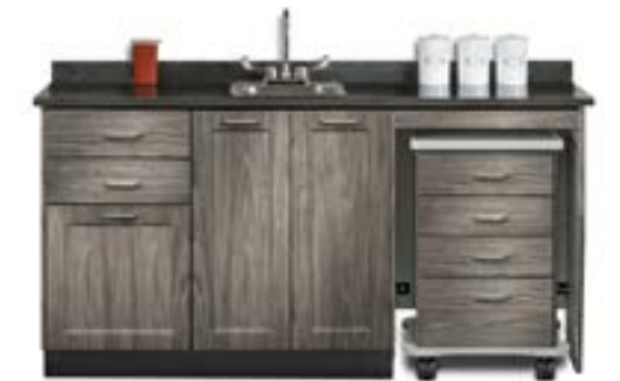
58066MR Shown with Optional -022 Sink