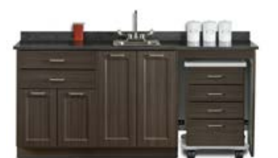
58072MR Shown with Optional -022 Sink

! WARNING: This product can expose you to chemicals, including chromium, which is known to the State of California to cause cancer and reproductive harm.