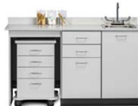
48060L Shown with Optional -022 Sink