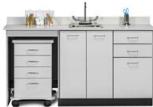
48066ML Shown with Optional -022 Sink