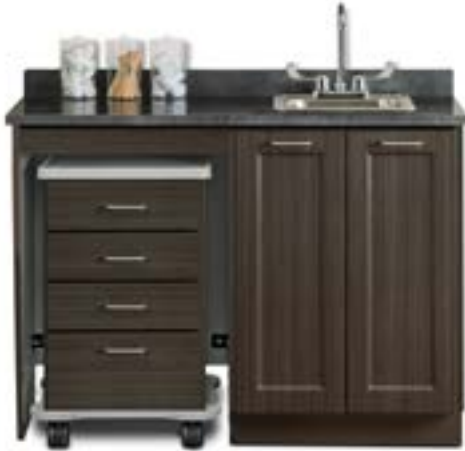
58048L Shown with Optional -022 Sink