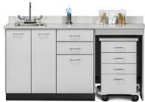
48066R Shown with Optional -022 Sink