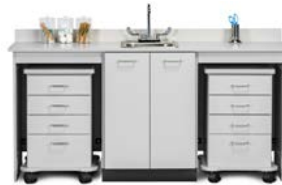
48072D Shown with Optional -022 Sink