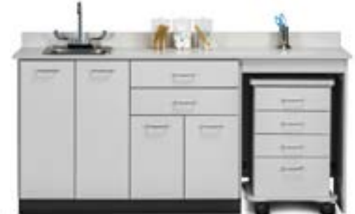
48072R Shown with Optional -022 Sink