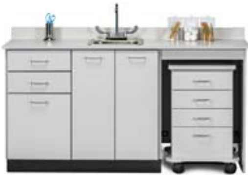
48066MR Shown with Optional -022 Sink