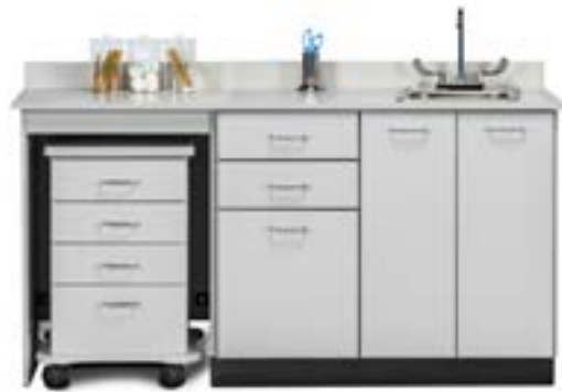
48066L Shown with Optional -022 Sink