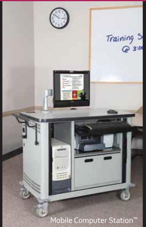
Mobile Computer Station™