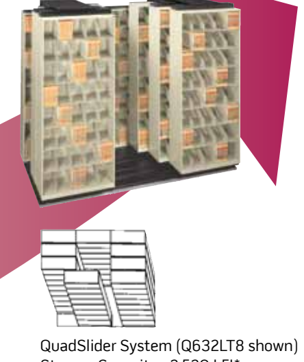
QuadSlider System (Q632LT8 shown Storage Capacity - 2,520 LFI* Footprint - 43 Square Feet

TriSlider System (T632LT8 shown) Storage Capacity - 1,960 LFI* Footprint - 32 Square Feet