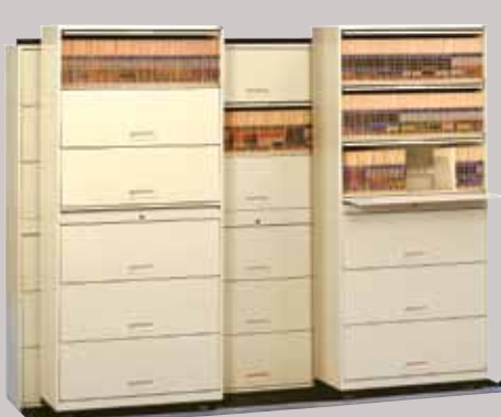
Stak-N-Lok™ Tiers offer locking retractable doors for security.

Reinforced steel track equipped with leveling guides every 12 inches on center creates a solid foundation that allows for smooth operation despite non-level floors. No permanent attachment to the floor is required.