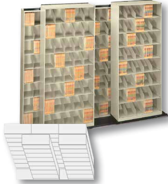
BiSlider System (B632LT8 shown) Storage Capacity: 1,400 LFI* Footprint: 22 square feet