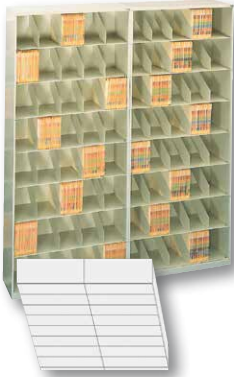
Stationary System (Two SO36LT8 shown) Storage Capacity: 500 LFI* Footprint: 7 square feet

All Datum ThinStak® tiers can be combined with TrakSlider™ Systems to improve storage capacity, access and retrieval of stored contents.