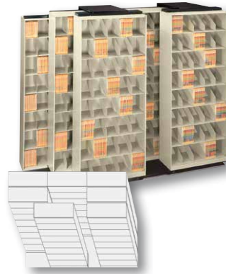
TriSlider System (B632LT8 shown) Storage Capacity: 1,960 LFI* Footprint: 32 square feet