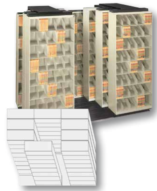
QuadSlider System (Q632LT8 shown) Storage Capacity: 2,520 LFI* Footprint: 47 square feet

*Capacities shown are based on letter-sized folders for 8-high, 36" wide units. Actual filing inches are based on type of media, width, and height of ThinStak® units and available floor space. Contact your Datum representative for different configurations based on your storage needs and space availability.