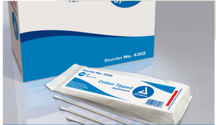
Cotton Tipped Applicators