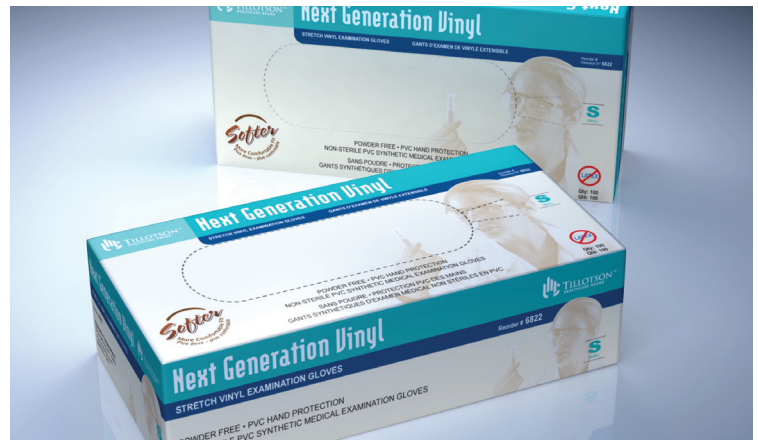
Next Generation - Stretch Vinyl Exam Gloves - Non-Latex