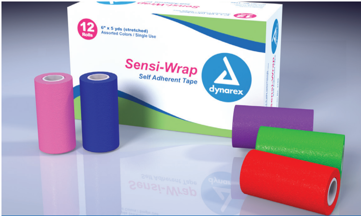
Sensi-Wrap Self-Adherent Bandage Rolls - Latex Content