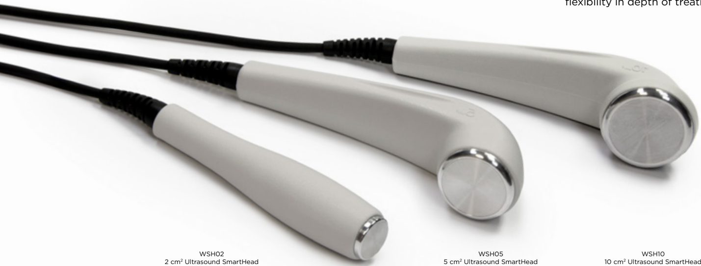
WSH02 2 cm 2 Ultrasound SmartHead

With the Dynatron 125 you can select three different frequencies without changing the soundhead. The 2 cm 2 , 5 cm 2 , and 10 cm 2 soundheads each operate at 1, 2, and 3 MHz, providing the greatest flexibility in depth of treatment.