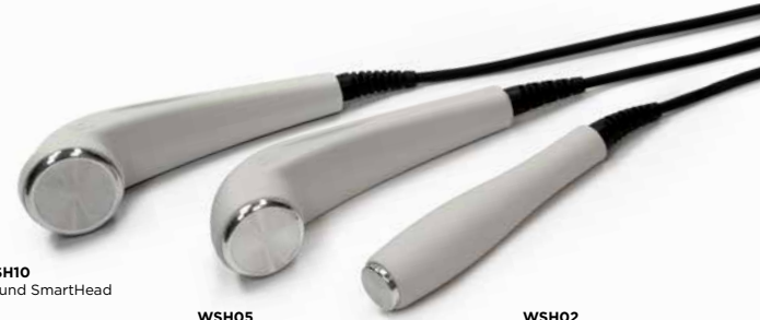
WSH10 10 cm² Ultrasound SmartHead