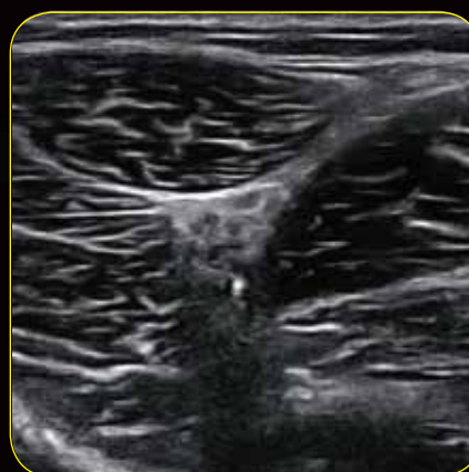
Sciatic Nerve Pop