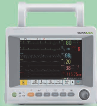
iM50 Patient Monitor