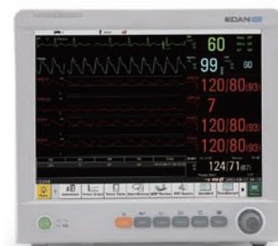
iM80 Patient Monitor

iM80 Patient Monitor if product design award 2012