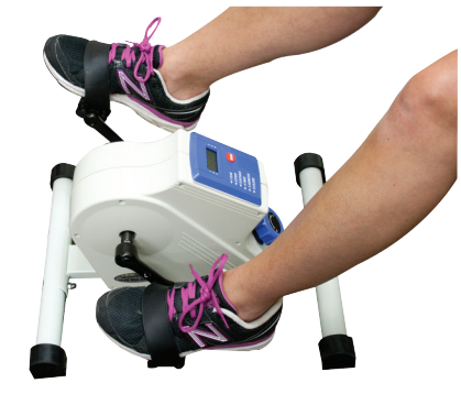
use with lower-body