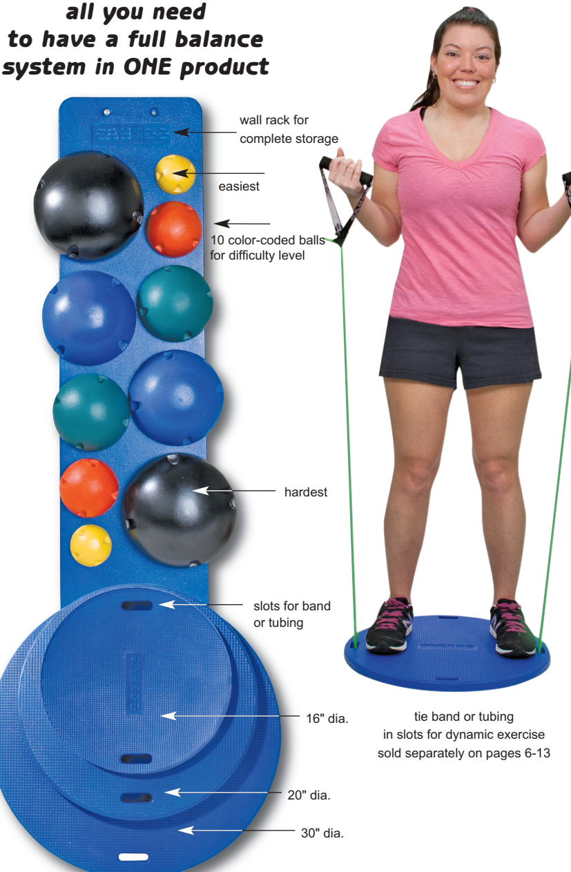
complete MVP® set shown