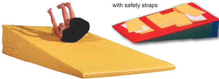
with safety straps