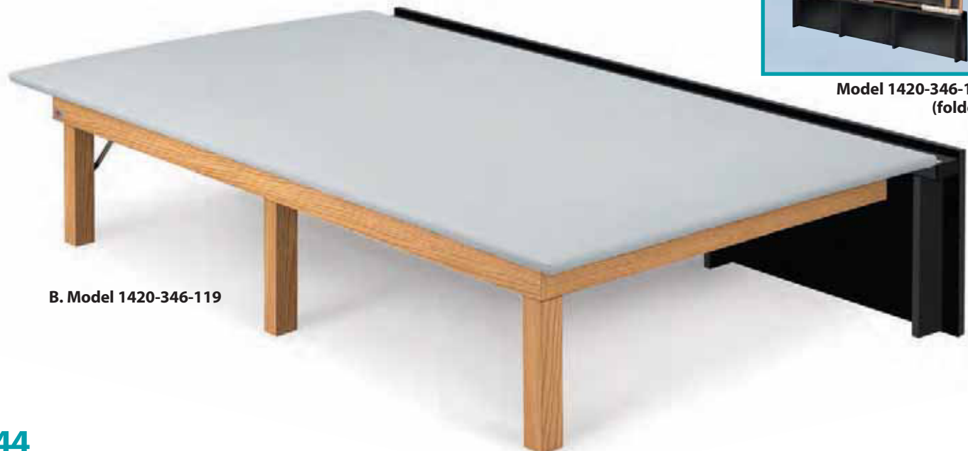
B. Model 1420-346-119