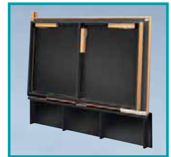
Model 1420-346-119 (folded)