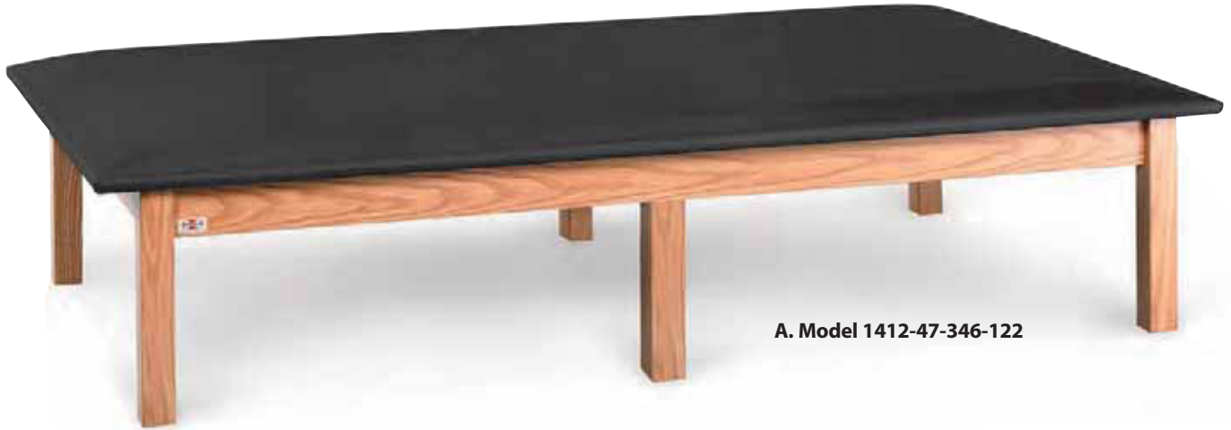
A. Model 1412-47-346-122