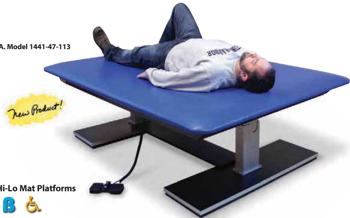
A. Model 1441-47-113