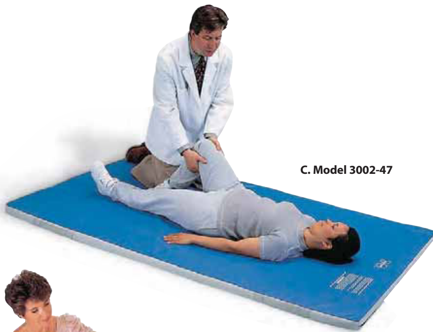
C. Model 3002-47