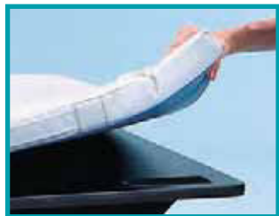
C. 3002-57 Mat attached with VELCRO® brand fasteners