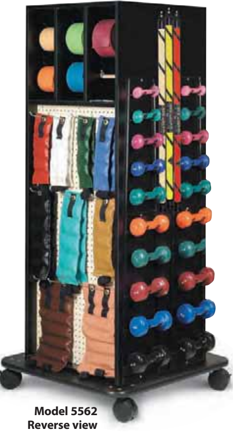
All weights and dumbbells shown must be ordered as accessories