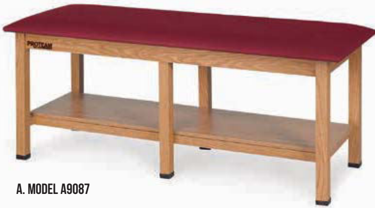
A. MODEL A9087