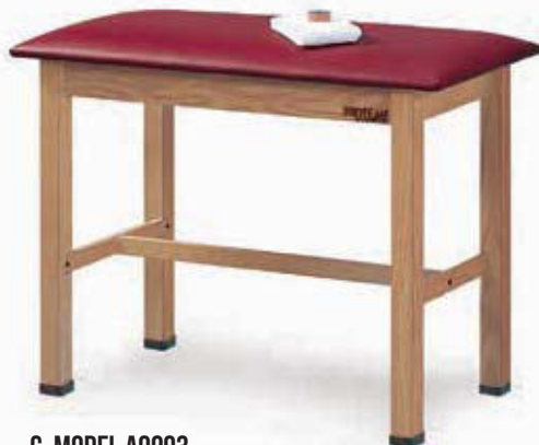
C. MODEL A9093