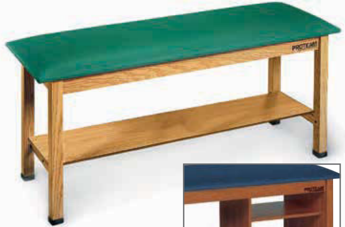
B. MODEL A9024