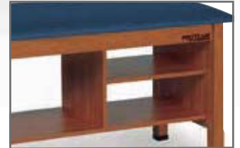
Model A9041 Open storage cabinet