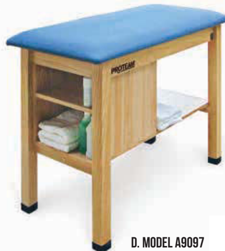
D. MODEL A9097