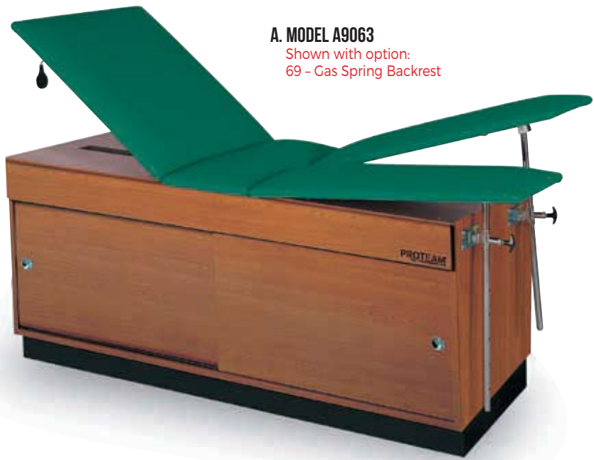
A. MODEL A9063

Shown with option: 69 – Gas Spring Backrest