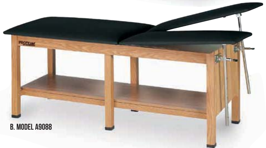
B. MODEL A9088