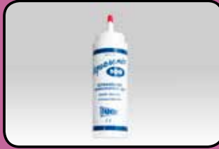
ACC3 Aquasonic Gel (box of 12x250ml)