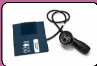
ACC188 BP Cuff+ BP Gauge with COLDER