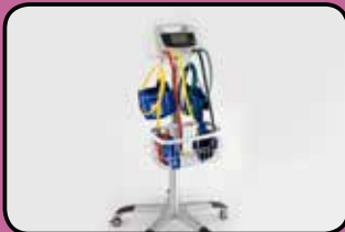
ACC- VAS-013 Pole Stand/Trolley (Requires Fixing Plate)