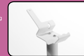
ACC52-2 Doppler stand (DMX Dopplers)