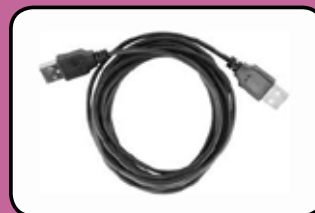
ACC-VAS-030 3m USB cable for use with DR5