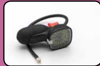
ACC168 Aneroid Sphygmomanometer (with trigger release & colder connector)