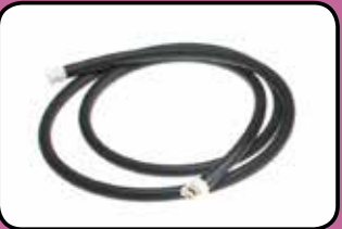
ACC167 Extension Tube 1m Male to Fe- male with Colder Connector