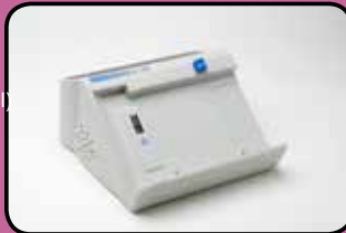
ACC214 Docking Station with USB Output for HP Printers