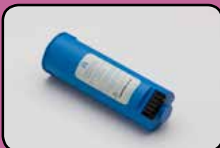
ACC100 Battery Pack