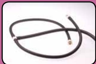
ACC166 Dual Garment 'T' Adaptor with Colder Connector