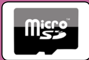
ACC227 Micro SD card - DMX only