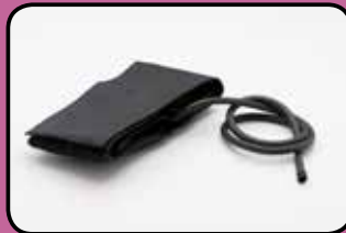
ACC164 Tourniquet Cuff with Colder Connector