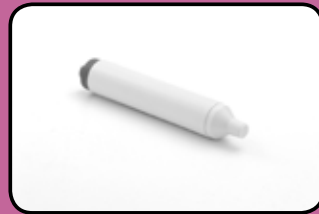
VP8XS High Sensitivity 8MHz Probe