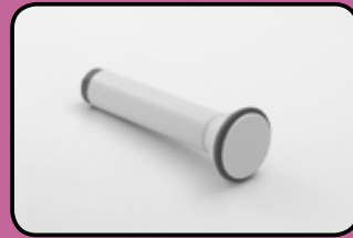
OP2XS High Sensitivity 2MHz Probe