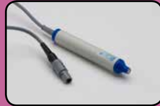
AVT8 8MHz CW Probe