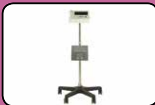
ACC103 Polestand - Mobile Trolley