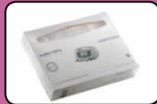
ACC- VAS-016 Infection Control Sleeves (box of 100)