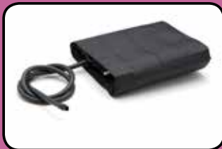
ACC160 Large Arm/Ankle Cuff with Colder Connector CL(31-40cm)