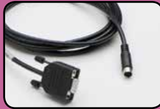
ACC35 Reporter cable