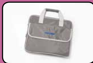
ACC- VAS-029 large carry bag - kits only