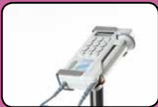
ACC52 Doppler stand MD2 only