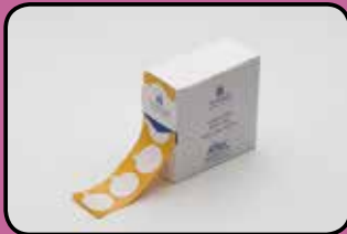
ACC56 Adhesive Rings (roll of 500)