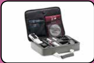
ABI KIT Ankle Brackial Index Kit