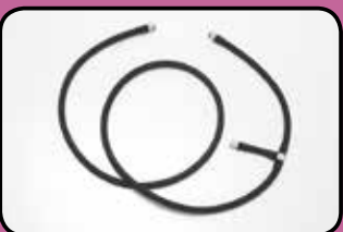
ACC- VAS-028 Toe Cuff Inflator system (DMX Doppler Only)