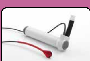
PPGA1 Arterial PPG adaptor and probe - DMX only