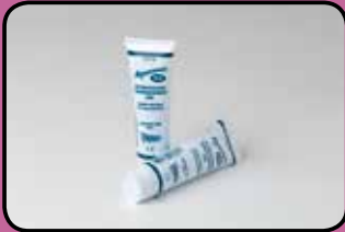
ACC24 Ultrasonic Gel - (box 12 x 60ml tubes)