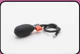
ACC165 Inflating Bulb with Colder Connector