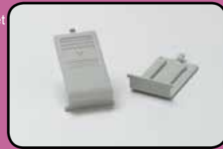
SP-726486 Battery Cover (D900 / SD2 dopplers only)