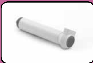
PA8XS Intraoperative Probe Adapter