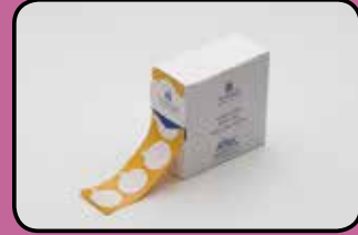
ACC56 Adhesive Rings (roll of 500)