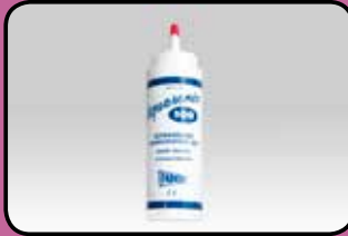
ACC3 Aquasonic Gel (box of 12x250ml)