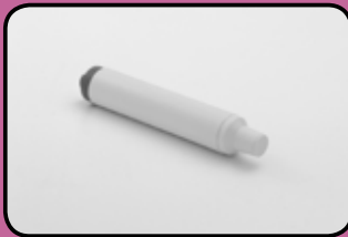
VP5XS High Sensitivity 5MHz Probe