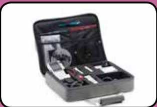
ATP KIT Ankle and Toe Pressure Kit