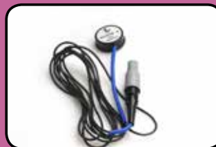
VPPG1 Venous PPG Sensor