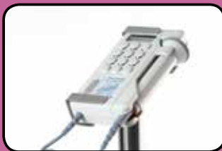
ACC52 Dopplex Stand