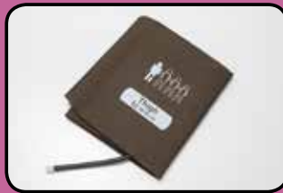
ACC161 Thigh Cuff with Colder Connector CL(38-50cm)