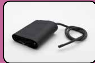
ACC159 Arm/Ankle Cuff with Colder Connector CL(28-33cm)