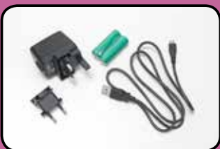
ACC226 Medical Grade Rechargeable Kit (DMX range only)