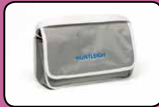
ACC34 Soft Carry Pouch