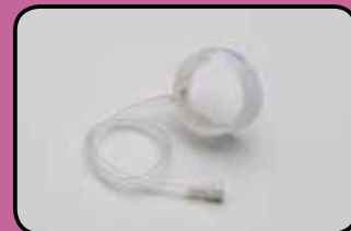
ACC162 Large Digit/Toe Cuff with Colder Connector (pack of 5) CL(2.5cm)