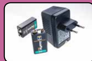
ACC171 Battery Charger (UK) (D900 / SD2 dopplers only)