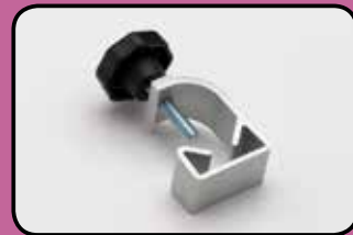
ACC47 IV Pole Clamp