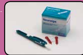
ACC224 Neuropen and Tips - includes 10g monofilament