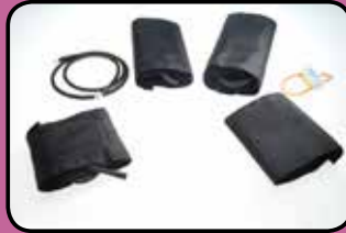
ACC158 Cuff Kit (all items with Colder connectors)