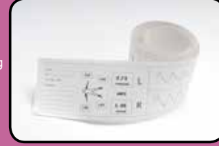
ACC- VAS-017 Standard Thermal Paper (pack of 5 rolls) ACC- VAS-019 Self Adhesive Thermal Paper (pack of 5 rolls)