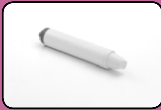
EZ8 High Sensitivity Easy 8 Wide- beam 8MHz Probe