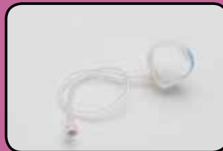
ACC163 Digit/Toe Cuff with Colder Connector (pack of 5) CL(1.9cm)