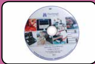
DVD-VL Vascular Educational Video Library