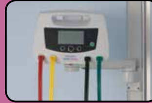
ACC- VSM-154 Wall Mount (Requires Fixing Plate)