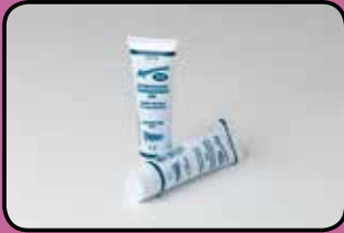
ACC24 Ultrasonic Gel - (box 12 x 60ml tubes)