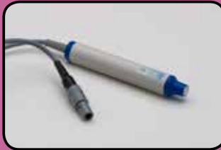
AVT4 4MHz CW- Probe