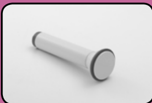
OP3XS High Sensitivity 3MHz Probe