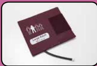
ACC160 Large Arm/Ankle Cuff with Colder Connector CL(31-40cm)