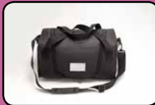
ACC- VAS-015 Carry Bag