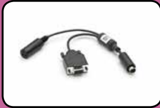
ACC150 VGA/Printer Cable Adaptor