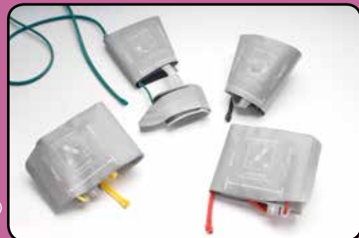
ACC- VAS-007 Large Right Arm Cuff ACC- VAS-008 Large Right Ankle Cuff ACC- VAS-009 Large Left Arm Cuff ACC- VAS-010 Large Left Ankle Cuff ACC- VAS-011 Large Adult Cuff Set (34-46cm) (4 cuffs as shown in image)