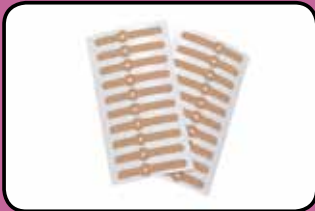
ACC179 APPG2 Adhesive Straps (pack of 240)