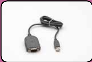
ACC190 RS232-USB Adaptor (use with DR4)