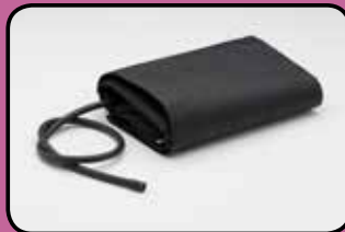
ACC161 Thigh Cuff with Colder Connector CL(33-50cm)