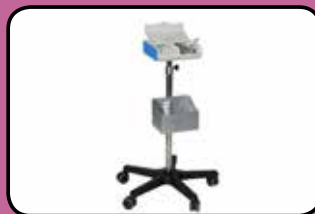
ACC180 Dopplex Stand for Dopplex MD200