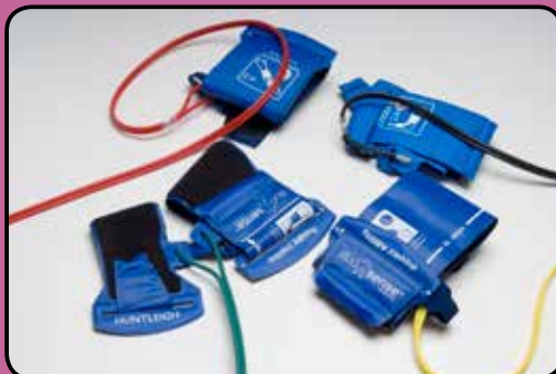
ACC- VAS-023 Adult Right Arm Cuff ACC- VAS-024 Adult Right Ankle Cuff ACC- VAS-025 Adult Left Arm Cuff ACC- VAS-026 Adult Left Ankle Cuff ACC- VAS-027 Adult Cuff Set (22-36cm) (4 cuffs as shown in image)