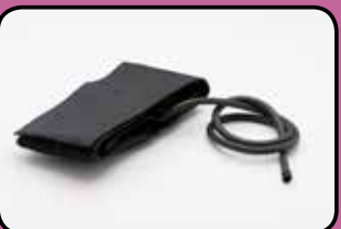
ACC164 Tourniquet Cuff with Colder Connector