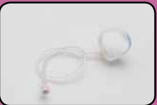
ACC163 Digit/Toe Cuff with Colder Connector (pack of 5) CL(1.9cm)