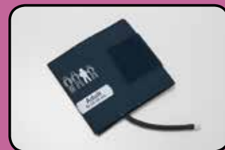
ACC159 Arm/Ankle Cuff with Colder Connector CL(23-33cm)