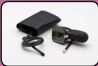
ACC188 Blood Pressure Cuff & Aneroid Sphygmomanom- eter with Colder Connector