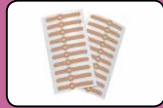
ACC179 Adhesive Straps (pack of 240)