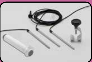
ISP3XS Intraoperative Probe Starter Pack