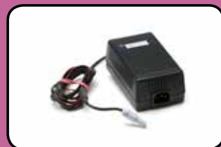
Acc105 Battery Charger