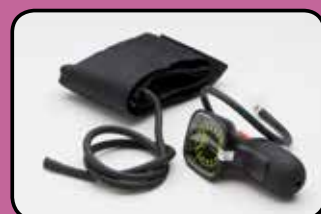
ACC187 Tourniquet Cuff & Aneroid Sphygmomanometer with Trigger Release Valve & Colder Connector