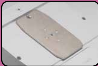
ACC- VAS-012 Fixing Plate (Required for Trolley And Wall Mount)