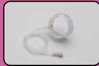
ACC162 Large Digit/Toe Cuff with Colder Connector (pack of 5) CL(2.5cm)