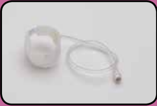
ACC185 Digit/Toe Cuff with Colder Connector Pack of 3 large & 3 small included