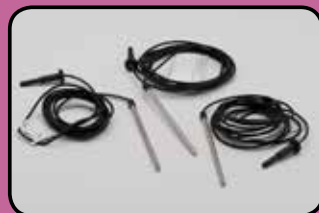
IPP3 Intraoperative Probe Pack