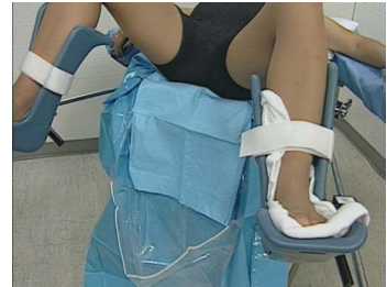
3. Draping is complete.