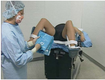
1. Orient Under Buttocks Drape with patient and insert right and left hands as marked.