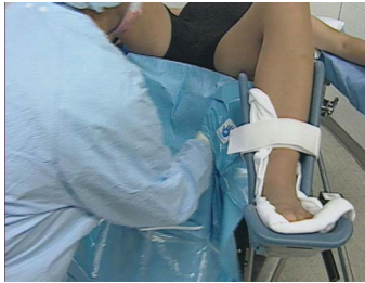
2. Slide drape under patient's buttocks.